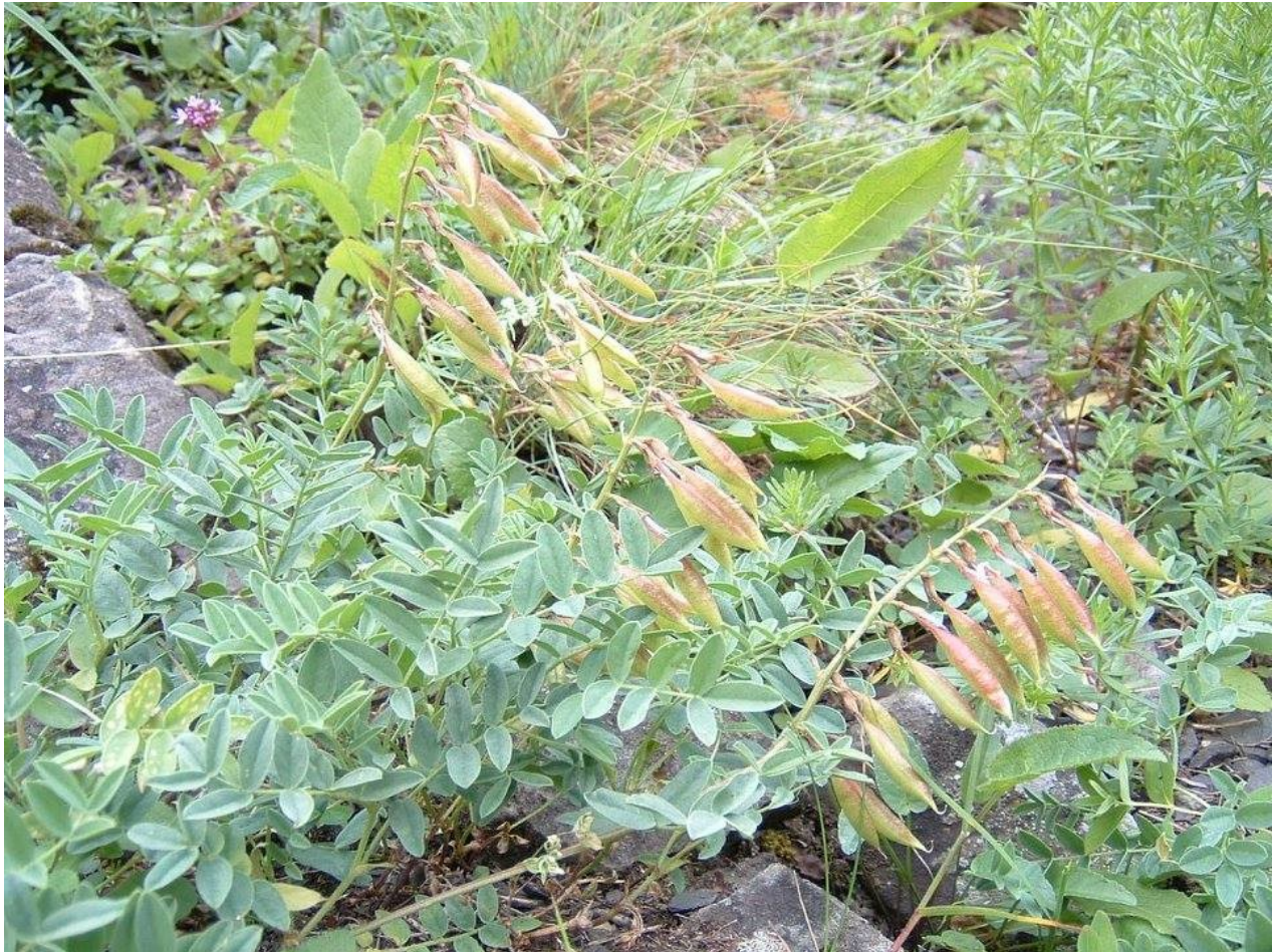
Figure 4. Astragalus rhacodes Bunge