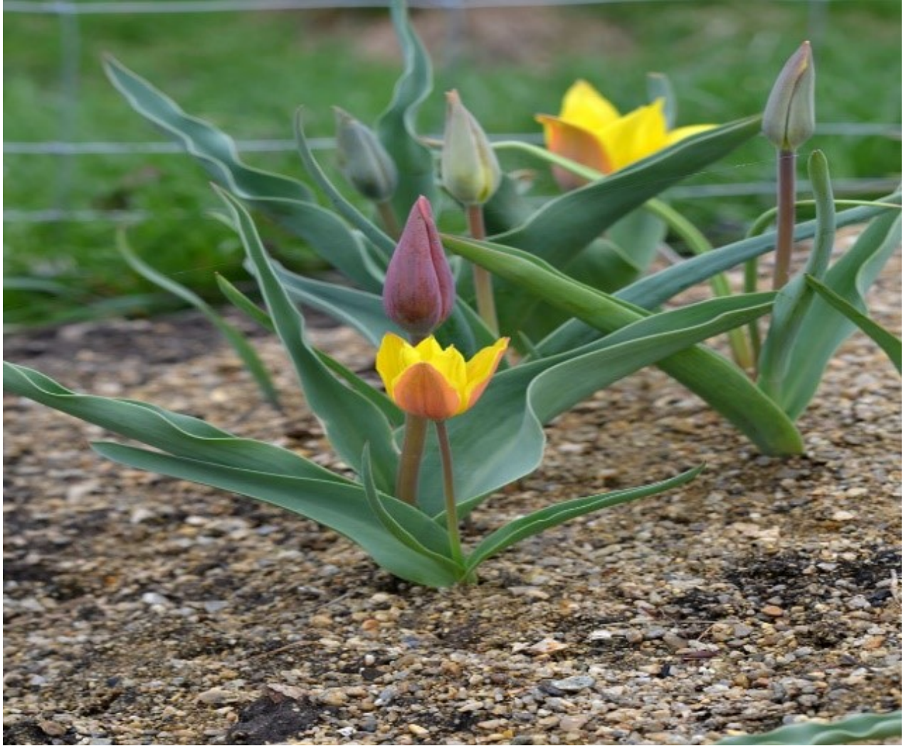
Figure 1. Tulipa ferganica Vved.