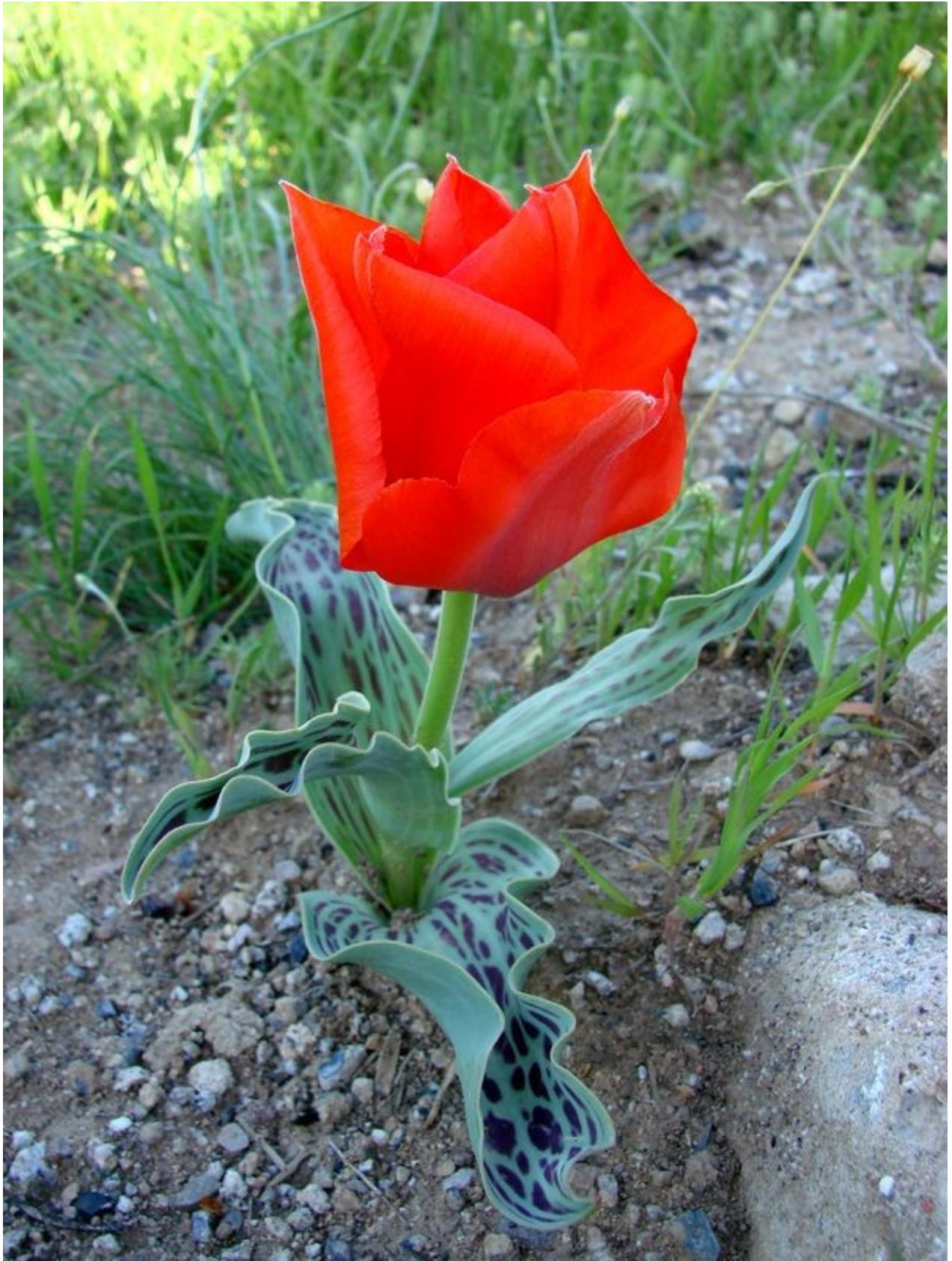
Figure 2. Tulipa greigii Regel