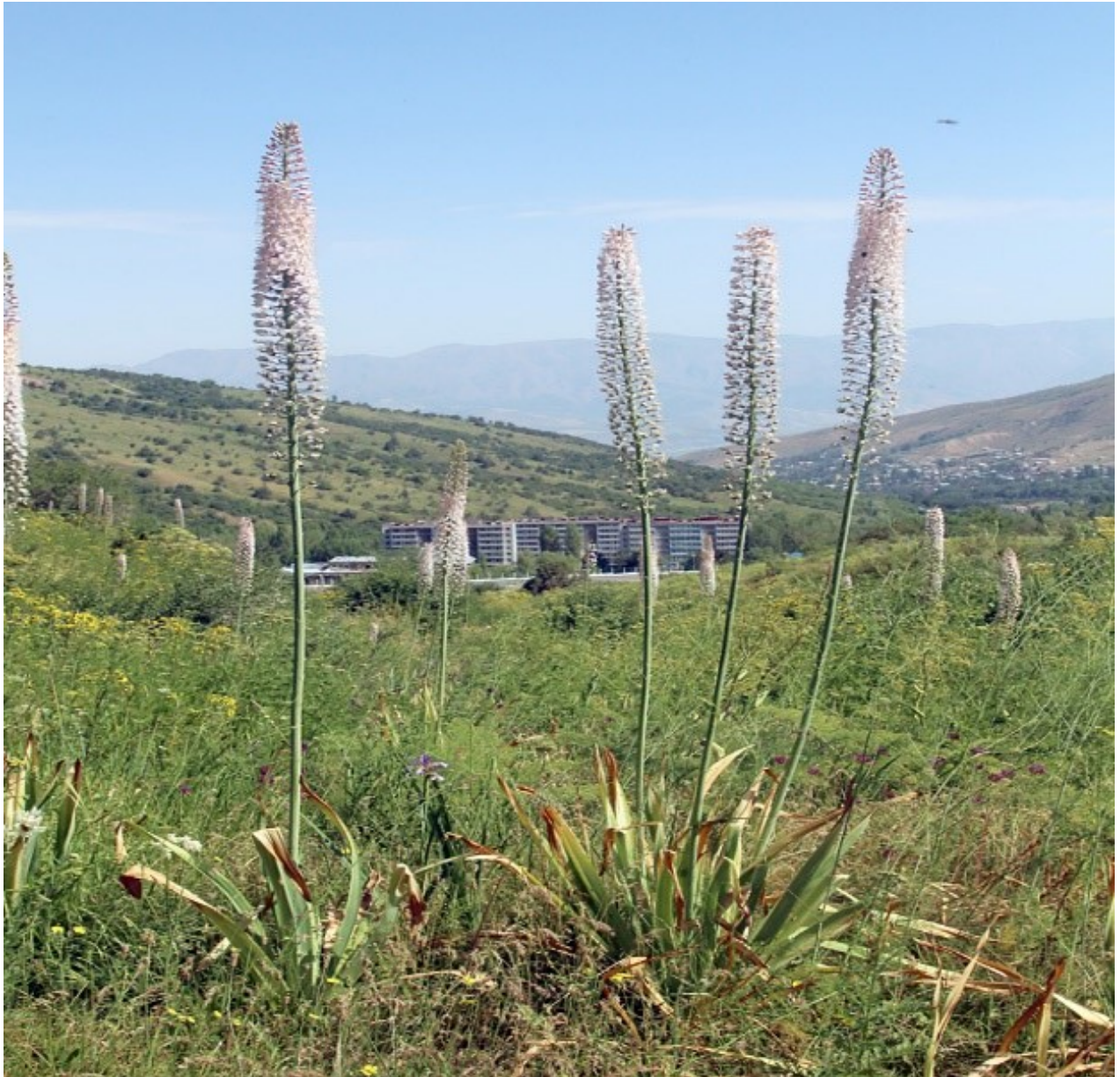
Figure 3. Eremurus robustus Regel