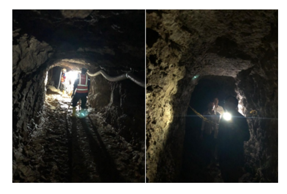
Figure 2. The condition of the opening hole is relatively damp

Here we can see the condition of the inside of this former mining working. The condition of the workings, which had not been visited for a long time, made it a little muddy and a bit dark.